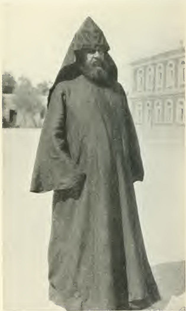
AN ARMENIAN BISHOP AT ETCHMIADZIN